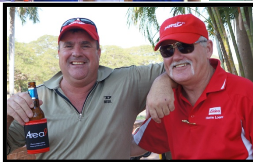
Above, left and below: Teams loved the Area9 stubby coolers given away throughout the day!